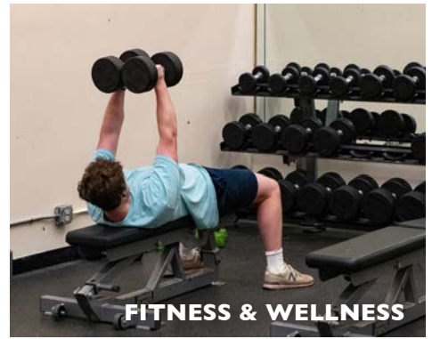
FITNESS & WELLNESS