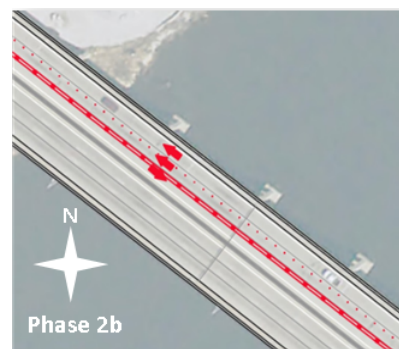
Phase 2b (duration approximately six months): Southbound bridge closed. Two lanes northbound and one lane southbound open on northbound bridge.

Project updates will be posted on electronic message boards near the project site, media alerts, norfolk.gov and Nextdoor. Find full details on the project and sign up for project update emails at www.norfolk.gov/5115/Campostella-Bridge-Rehabilitation .