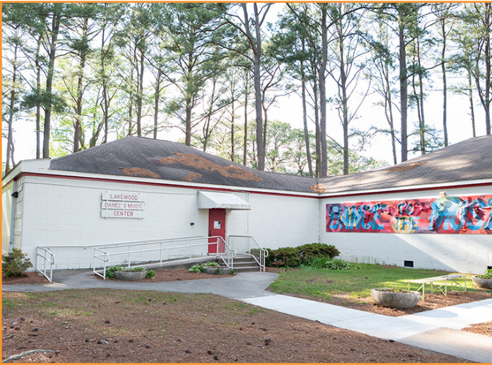
Lakewood Dance & Music Center