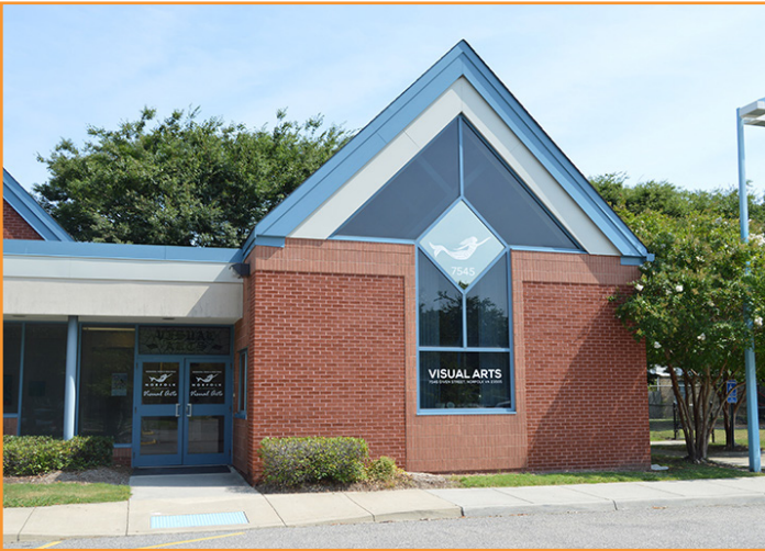
Titustown Visual Arts Center